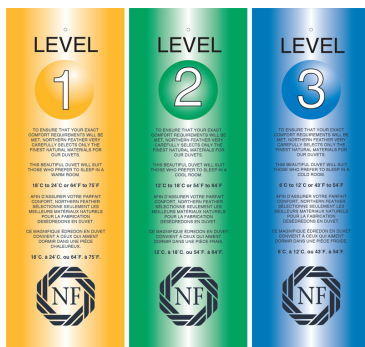
Each of our duvets are packaged with a duvet level tag for easy recognition

In order to find the right pillow, it is important to keep your personal preferences as the most important factor. What is inside a pillow makes a difference in support - some pillows are more squeezable, some will have more “oomph”, while others are in between. To maximize the options, Northern Feather Canada offers three distinct densities: soft : best for stomach sleepers, medium : best for all-around or back sleepers and firm : best for side sleepers.