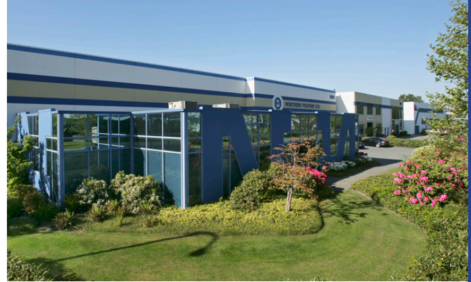
Our head office and manufacturing plant is located in Delta, B.C., Canada.

Northern Feather Canada offers the best value and quality in down and man-made fibre sleep products utilizing the highest and most technically advanced standards in manufacturing. We apply the latest in textile design, material processing and quality control becoming the experts of the down and feather industry. Making luxury bedding products at good value and providing the ultimate in sleeping comfort at the highest level of quality is what Northern Feather Canada does best.